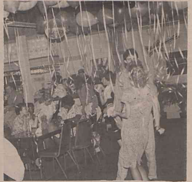
Students and faculty enjoy the SGA-sponsored Fall Dance at Bogart's.