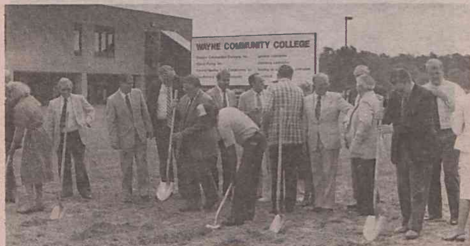
Local politicians, construction supervisors, and college officials participate in ground breaking ceremonies held on July 30, 1990.