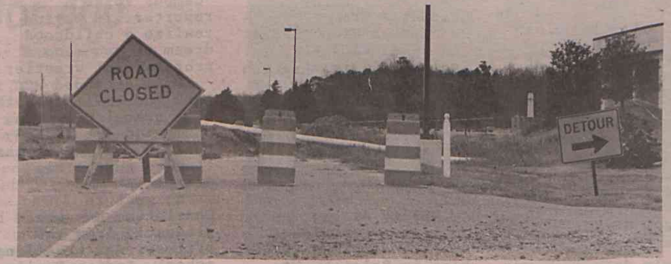
Closed road created detours on rough roads while clean up was in progress.