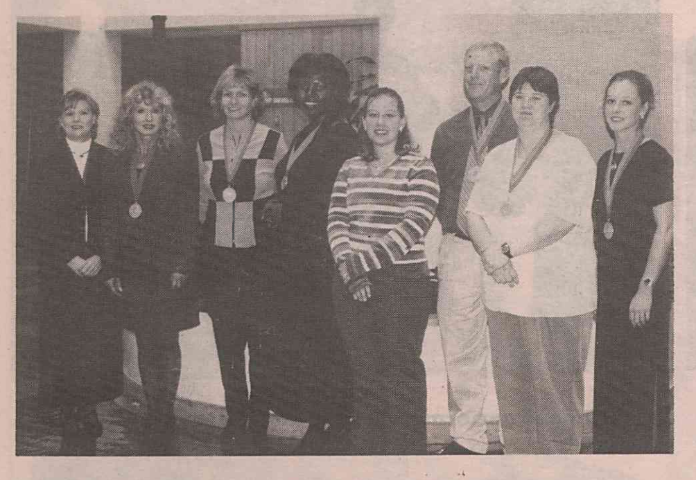
Officers and advisors of Phi Theta Kappa pose for a formal shot following the initiation of new members.