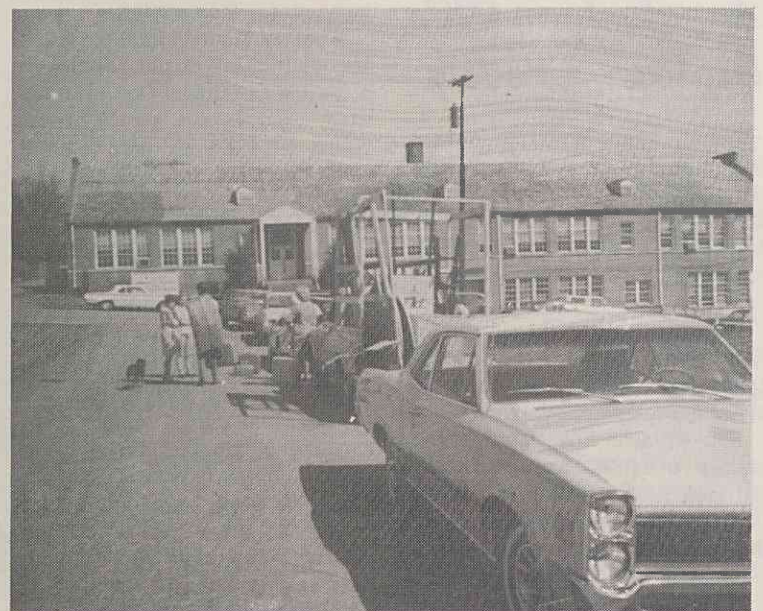
GETTING READY TO LEAVE