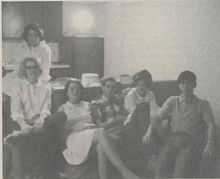
THE DAY AFTER THE NIGHT BEFORE