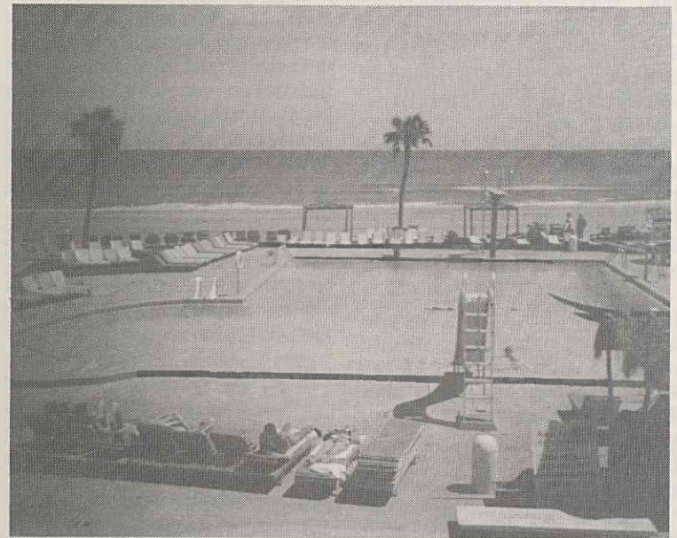
FROM THE BALCONY AT DAYTONA BEACH