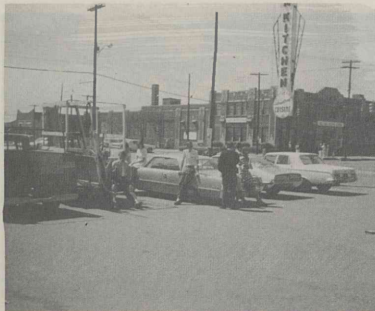
AFTER LUNCH IN CHARLOTTE