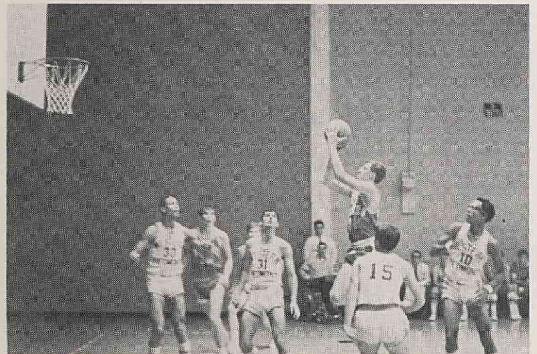
Morganton Defeats WCC