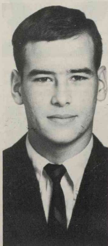
STANLEY WHITTINGTON Senator