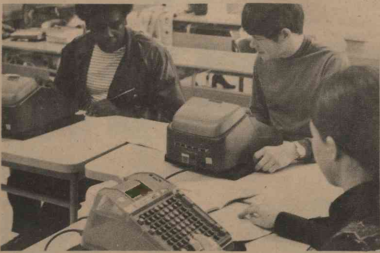
TOMORROW'S ACCOUNTANTS AT WCC