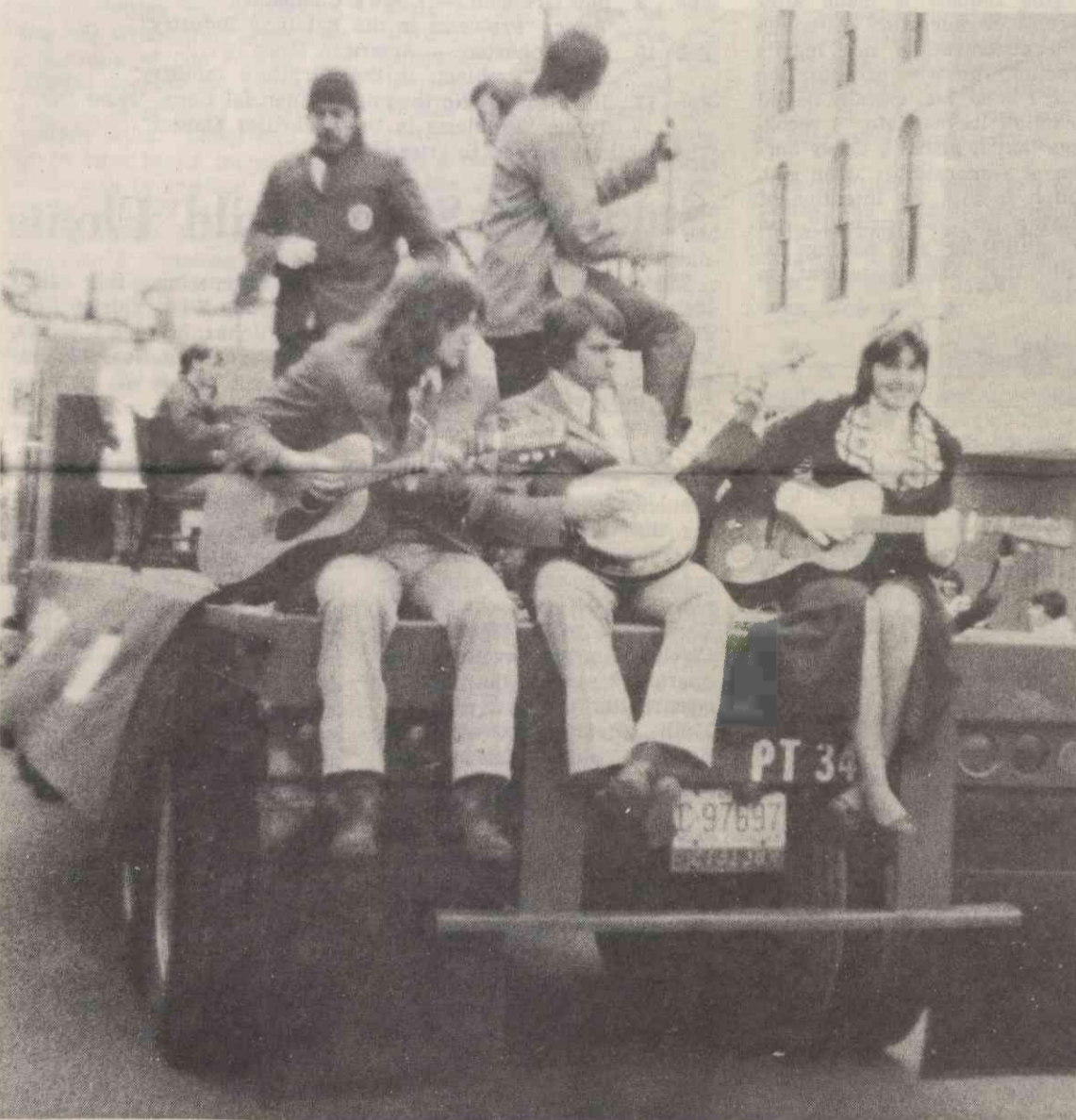
SCENE FROM PARADE