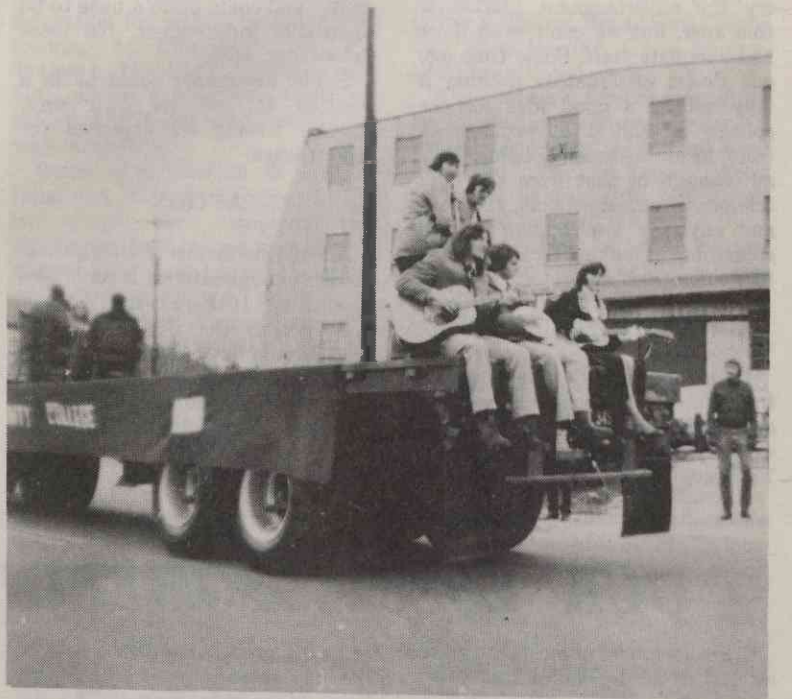
BLUE GRASS BAND