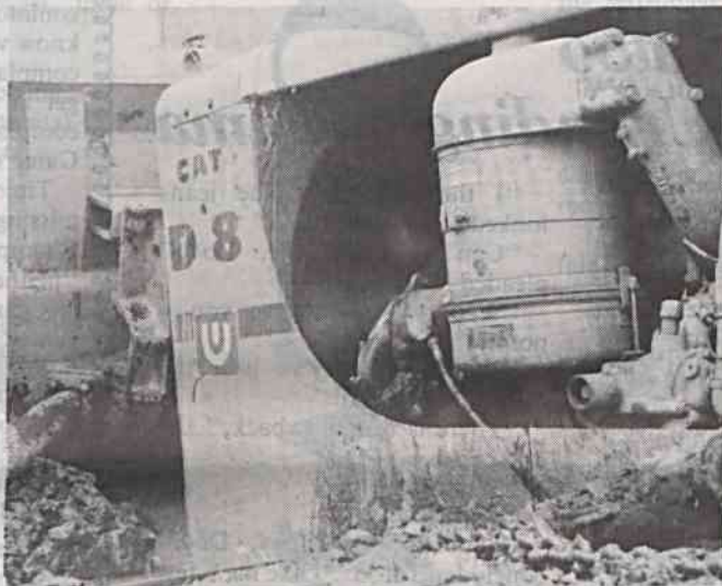
"HEY! THE AIR CONDITIONER IS STILL ON!"