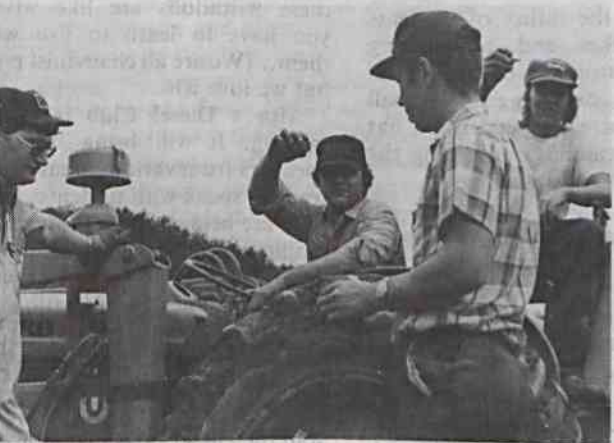
"WHO WAS DRIVING THE BLOODY THING ANYWAY?"