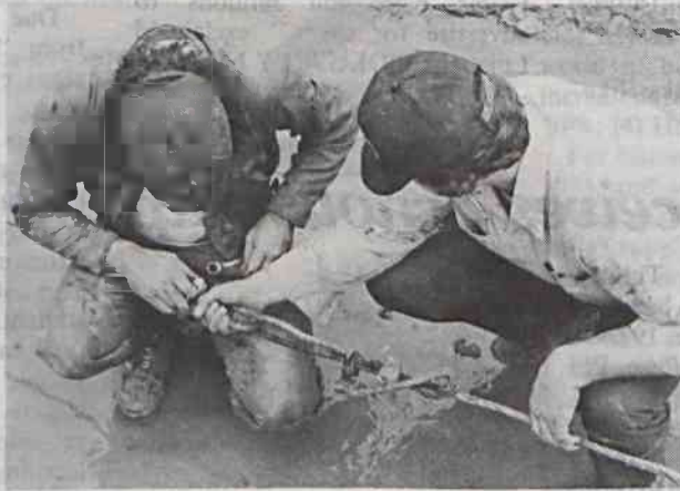
"GOT THE ELMER'S?"