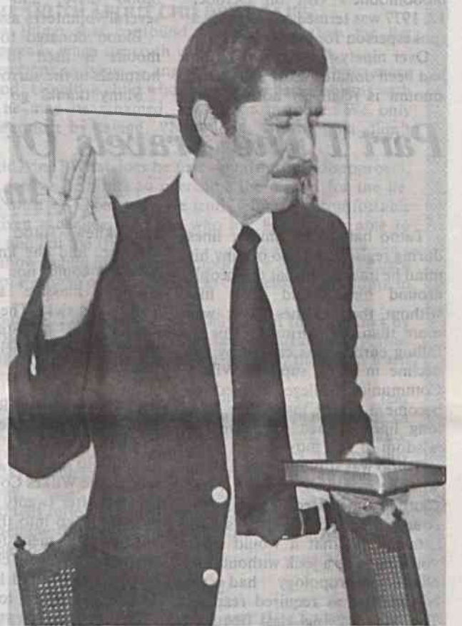
I'LL SWEAR... (YOU SHOULD HEAR HIM WHEN HE'S ANGRY)