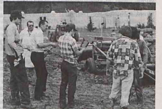
"RAISE YOUR HAND IF YOU WANT TO BE EXCUSED."