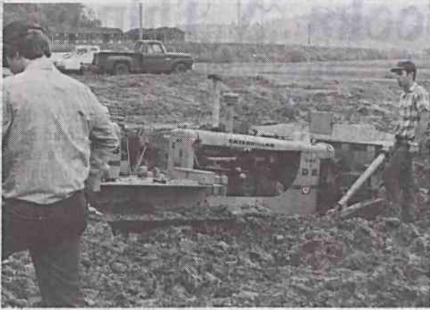
"MAYBE IT WILL TURN INTO A BUTTERFLY?"