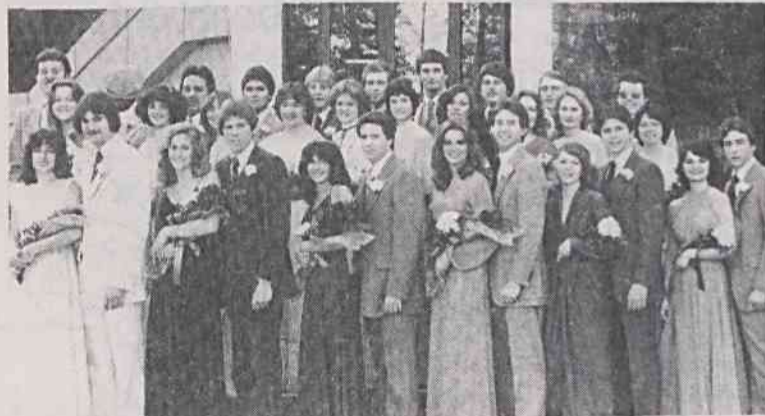
Homecoming Candidates and Escorts