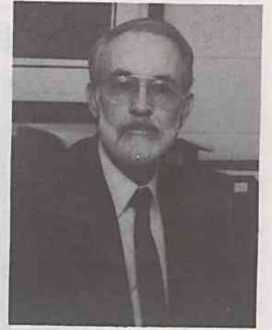
Mr. Tony Randall