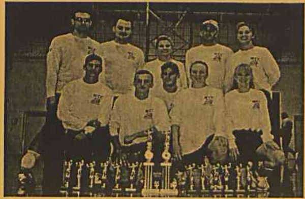
cougar volleyball champions!

Try-outs will begin on September 16th from 3:00 p.m. - 5:00 p.m. for all new students interested in playing. Please try to attend the athletic meeting on September 12th if interested. Check the posted schedule and try to attend all our home games and support your fellow classmates. Thank You! Coach Smith