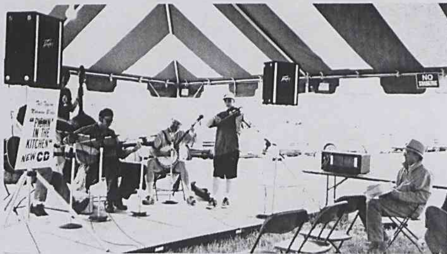
(Above) Pickin' and Grinnin'

have met many people and we enjoy the good food here. We come here every year."