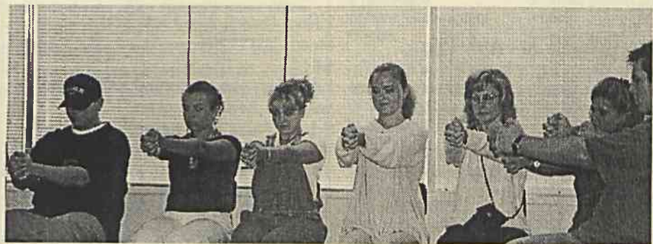
Volunteers in the Ronny Romm Hypnotist Show await instructions from Ronny as they prepare to be hypnotized.