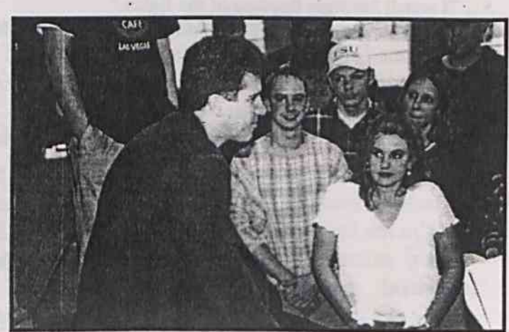
Students gather to hear Mentalist