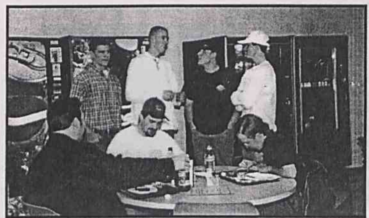
Lunch time in the new commons