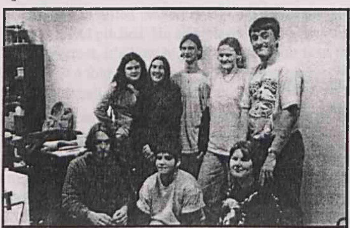
1998 Newspaper Staff