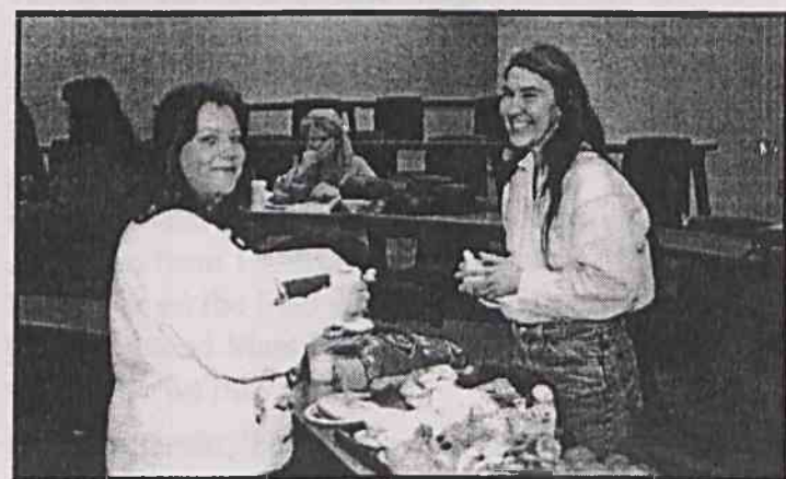
"Healthy Eating Habits" Workshop