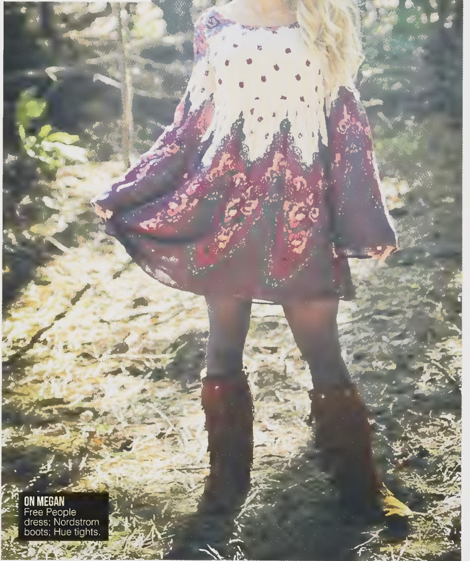
ON MEGAN Free People dress; Nordstrom boots; Hue tights.

Tired of the LBD? We are too. Put some pizzazz back into your wardrobe with not-so-boring frocks of every color and print. Printed dresses are fresh and vibrant and will really show off your personality. To avoid looking like wallpaper, choose a non-busy print with hues in the same color family.