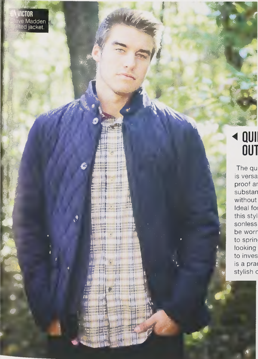
ON VICTOR Steve Madden quilted jacket.