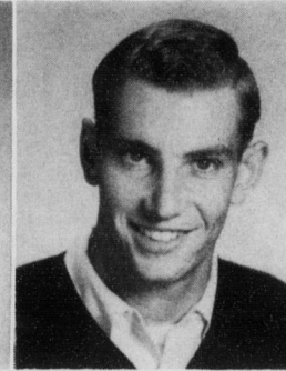
BOWEN President MSG