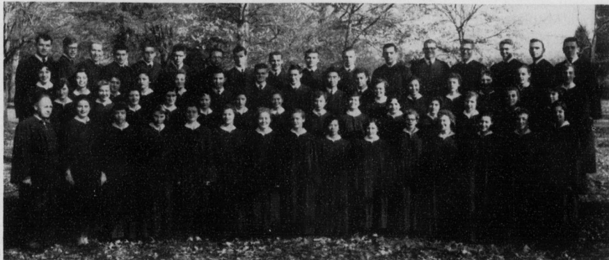
The Guilford College A Cappella Choir

Each year Guilford College selects the Miss and Mr. Representative Future Teacher to be presented at the Annual Convention of the North Carolina Education Association. They are chosen on the basis of such qualities as intelligence, enthusiasm, integrity, leadership, emotional stability and general understanding in the field. This year the convention will be held at Wilmington, North Carolina from March 21-23.