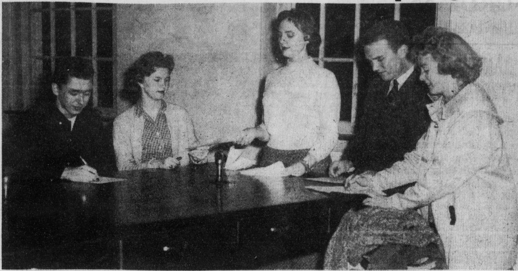
Guilford Students Vote For Their Favorite Candidates In Spring Elections