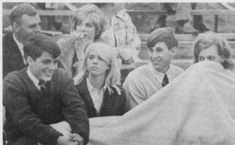
Even A Blanket Couldn't Keep off Saturday's Chill...