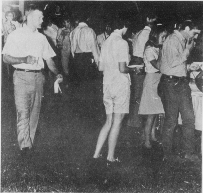
En Masse Attendance at The Luau