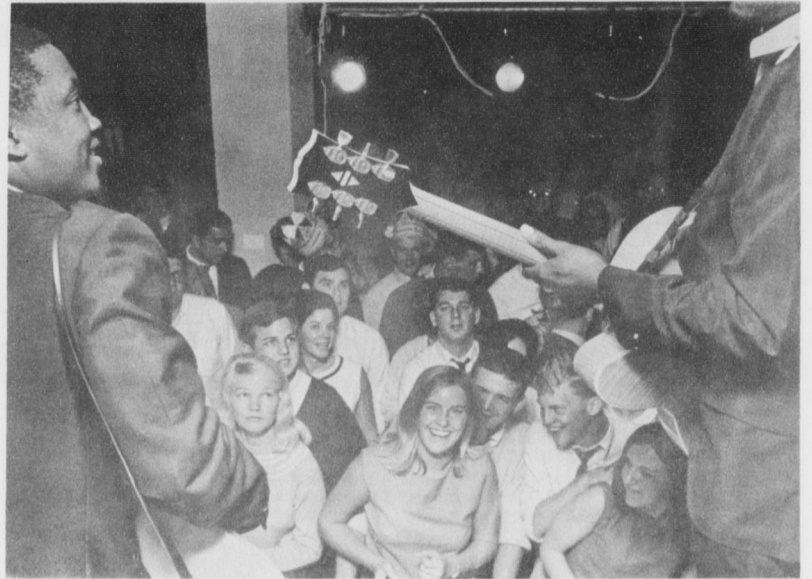
Time for The SHIRELLES