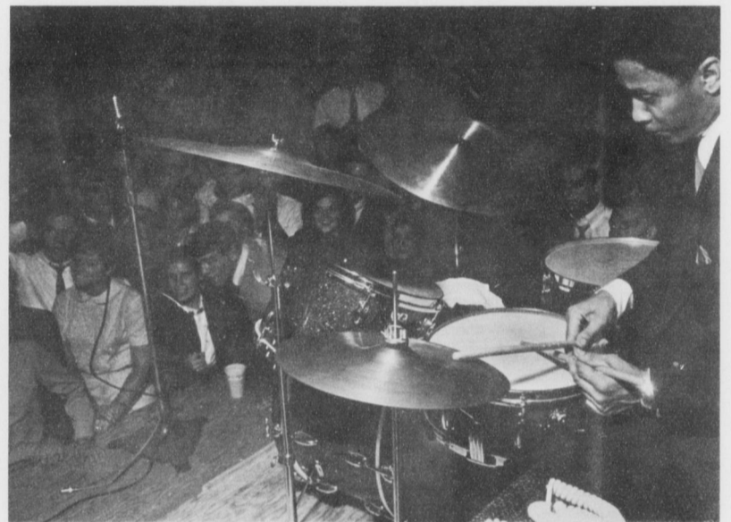
'Give The Drummer Some'