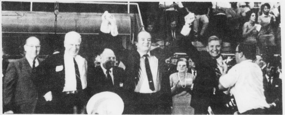
"HEIL HUMP"!—North Carolina's Junior Senator B. Everette Jordan looks on as Hubert Humphrey triumphantly joins hands with former N. C. Governors Luther H. Hodges and Terry Sanford (right).

Blacklights • Posters Incense • Water Pipes • Guru Clothing Warren's, Inc. Psychedelic HEADquarters IN GREENSBORO 2168 Lawndale Dr. Phone 274-3551 Greensboro