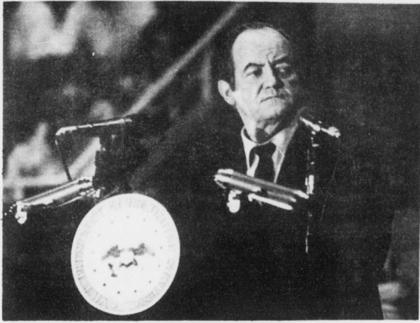
"The Politics of Joy"