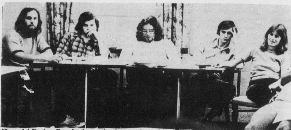
Financial Review Board takes active interest in exciting Town Meeting proceedings.

no fewer than eleven spelling and grammar errors led one student to comment that there also seemed to be a need "to fill the vacuum in English education."