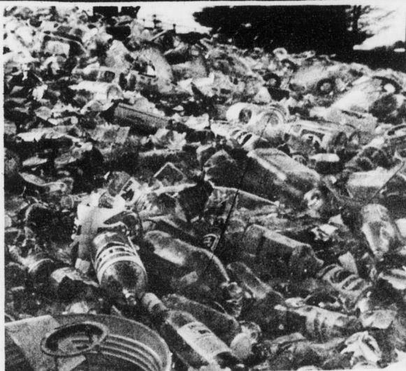
Biophile will close down their recycling center this week.

We are inviting everyone on campus and in the community to come to the Urban Center at 1:00 on Saturday and join us as we try to build another bridge in this world of "gaps".