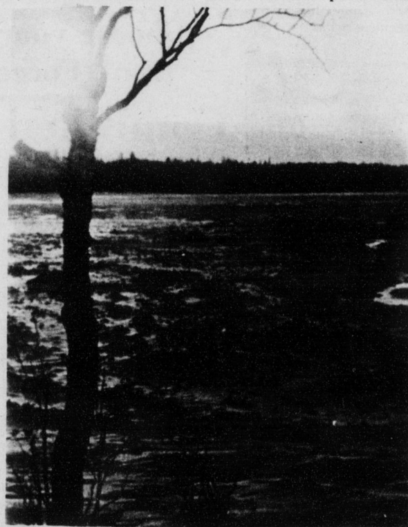
a Break of sunshine for you.

The exhibition, which includes, oils, drawings and landscapes, may be viewed free of charge from 9 a.m. until 5 p.m. daily and from 12 noon until 5 p.m. on Sundays.