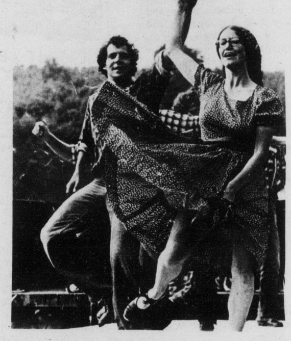
Apple Chill Cloggers perform with Highwoods Stringband on Saturday. See pages 4 and 5 for more details.