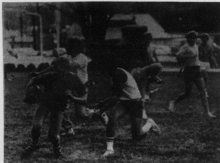
The Nads of Milner third South whooped the Wahoos November 5, ending the Intramural flag football season.