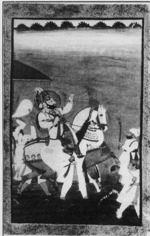
Rajput, Early XIX Century Rana Bhim on horseback