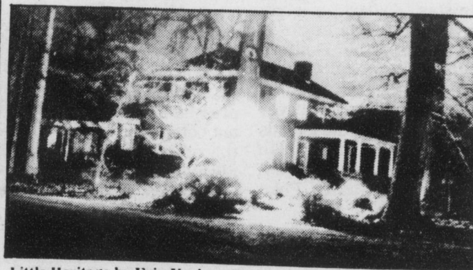
Little Heritage by Eric Yuck