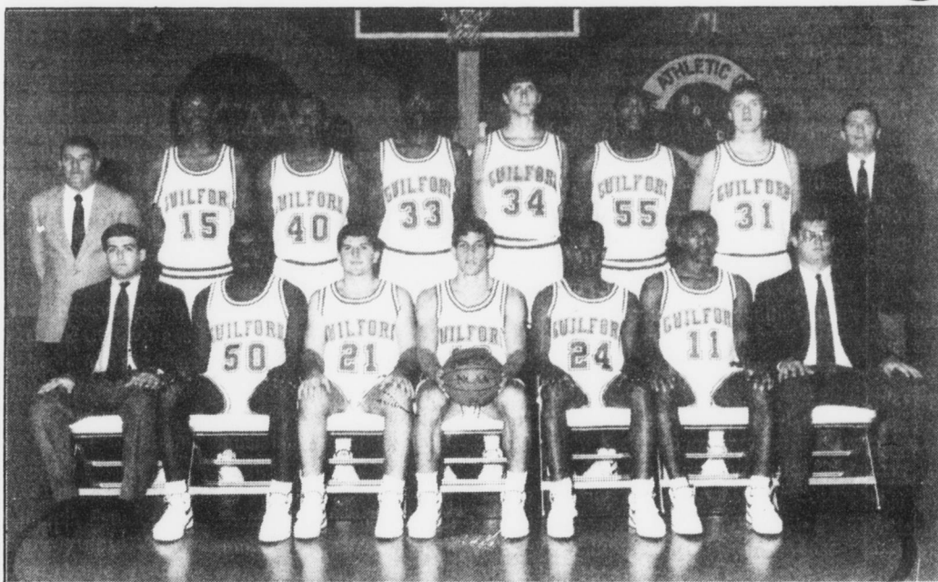
The 1992-93 Guilford College men's basketball team