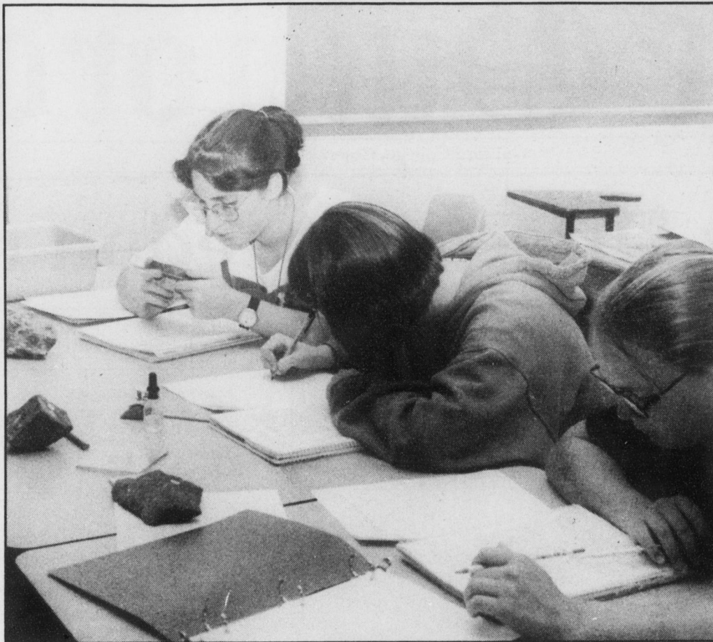
Students identify rocks in physical geology lab.

A video and slide show/meeting for prospective students for spring 1994 semester abroad in Castle Brunnenburg will be held Sept. 27, 7:30 p.m. in the Leak Room of Duke. It is open for all interested students.