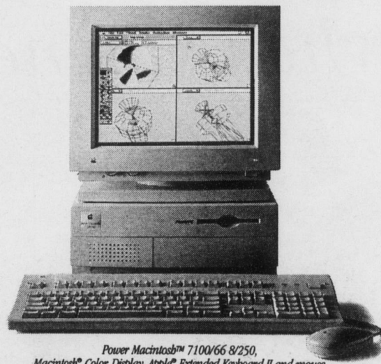
Power Macintosh™ 7100/66 8/250, Macintosh® Color Display, Apple® Extended Keyboard II and mouse. Only $4161.95.

Speed. Power. And more speed. That's what the new Power Macintosh™ is all about. It's a Macintosh® with PowerPC™ technology. Which makes it an incredibly fast personal computer. And the possibilities are endless. Because now you'll have the power you need for high-performance applications