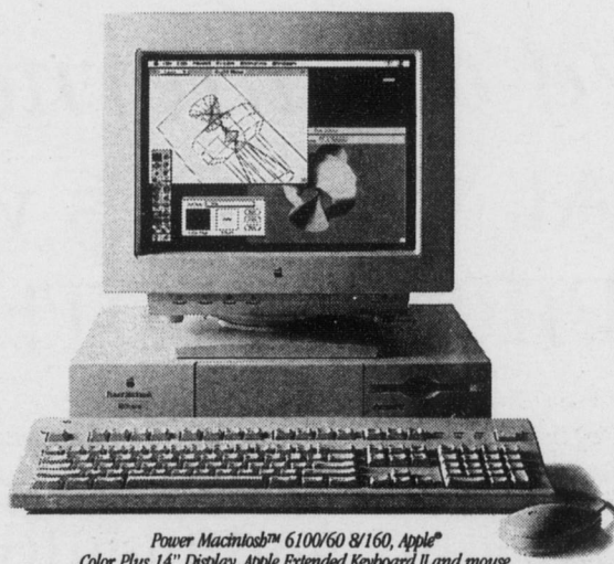
Power Macintosh™ 6100/60 8/160, Apple® Color Plus 14" Display, Apple Extended Keyboard II and mouse. Only $2,005.44.