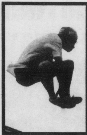
A lone figure hovers in the air, hoping to land with his feet on the the ground....

This calendar is compiled by the staff at wqfs and announced on-air daily at 12:15, 5:15 and 7:15.