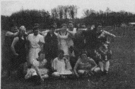
Women's Rugby: Dressed to Kill