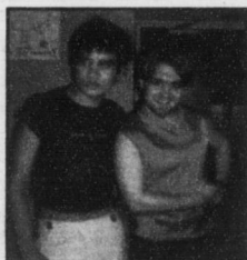
Coming out Ball approaches