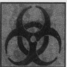
Mechanics of a BioHazard