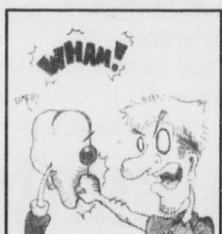
I'm right, you're wrong, so deal