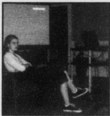
Students attend second Town Hall Meeting