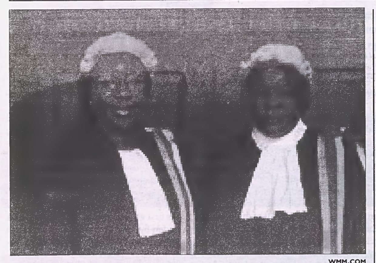
"SISTERS IN LAW," ONE OF THE FILMS BEING SHOWN.