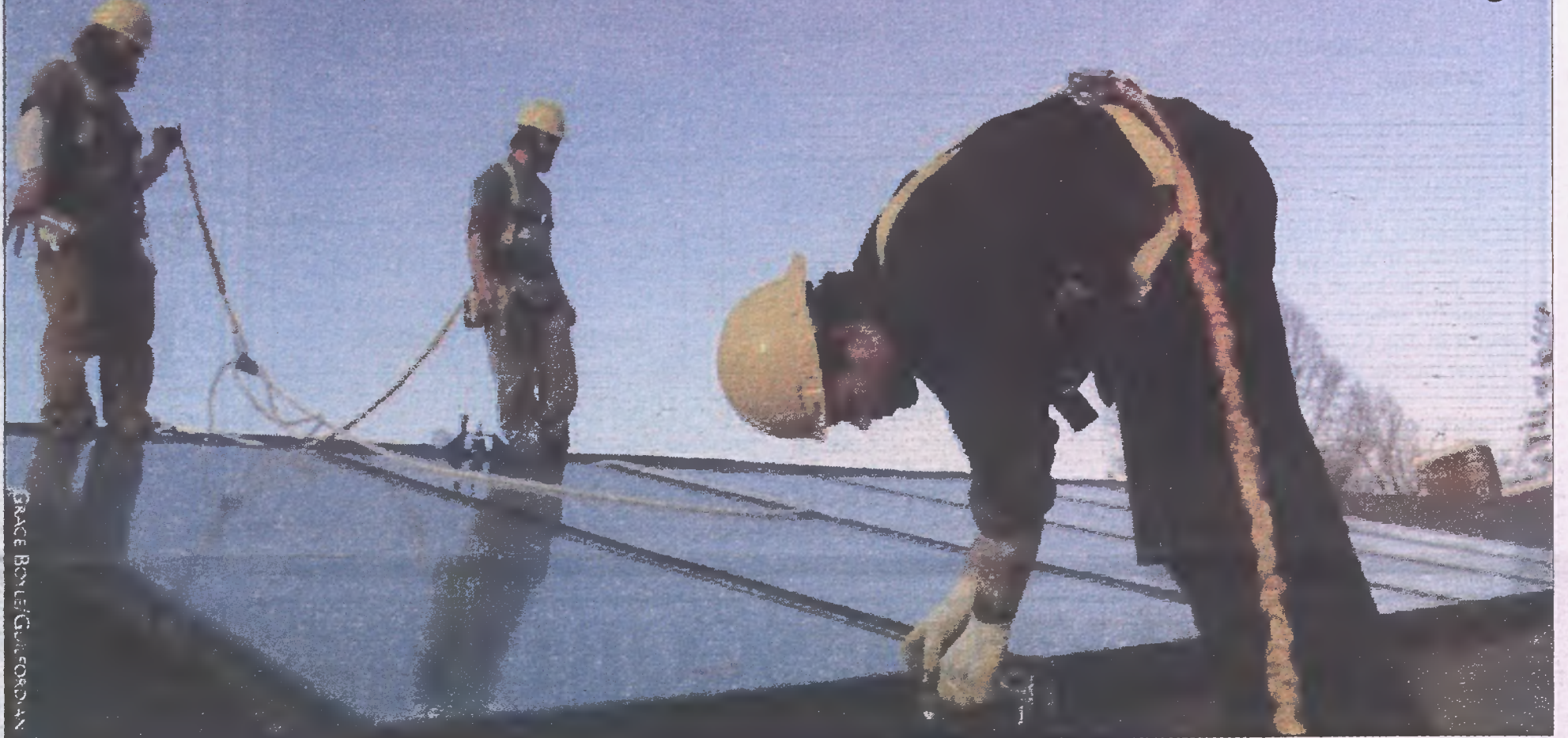
THE SOLAR PANELS RECENTLY INSTALLED ON THE ROOF OF SHORE HALL ARE NOT THE ONLY ENVIRONMENTAL PROJECT ON CAMPUS.