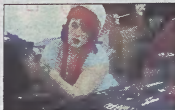
Halloween Fest by Ashley Lynch