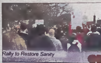
Rally to Restore Sanity