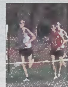
Fall sports update