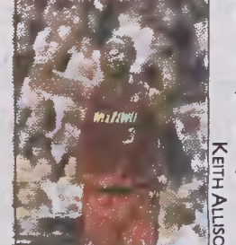
Impressive roster fails to bring Miami Heat