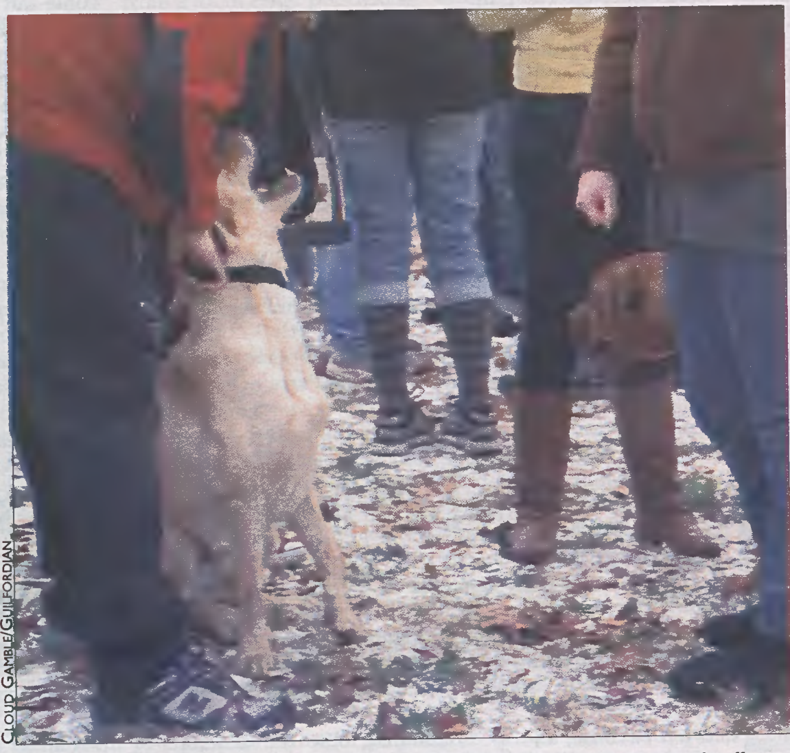
Students bear the cold on Dec. 8 for a chance to relax with pups and cups of coffee. The stress-less event was organized by the new Guilford club, Active Minds, a chapter of a larger national organization that aims to improve dialogue about mental health.

NEW CLUB AIMS TO RAISE AWARENESS OF MENTAL HEALTH ISSUES AND SUICIDE PREVENTION