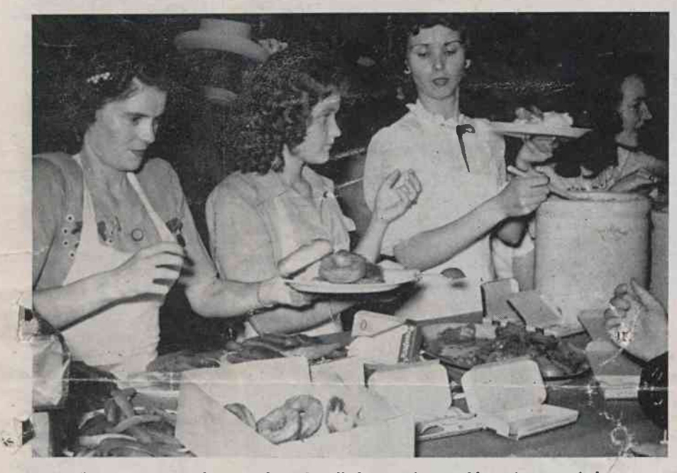
Supper was served promptly and well due to the capable assistance of the group above, which was part of the force manning the barbecue pit.