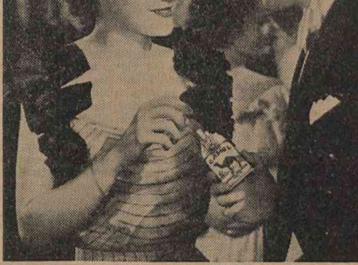
CONDITION IS IMPORTANT TO YOU TOO - on vacation, in college, at home. You can keep "in condition," yet smoke all you please. Athletes say: "Camels never get your wind."