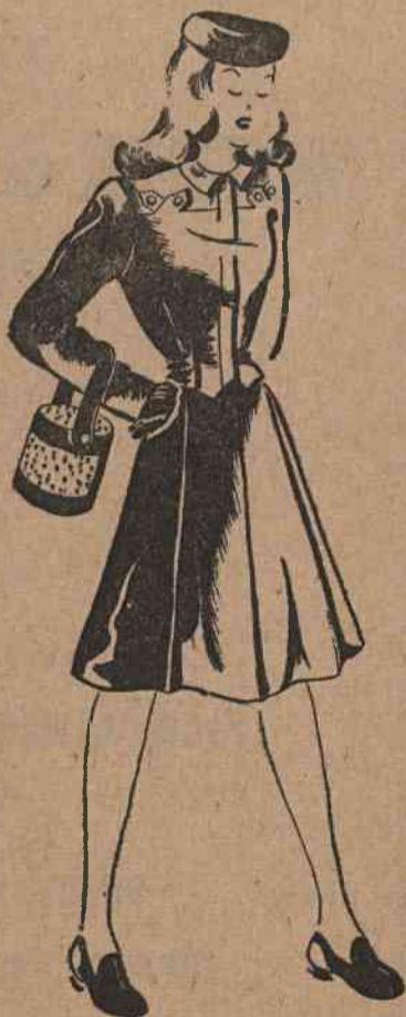
Two piece suit of grey Julliard flannel. Featured in MADEMOISELLE.