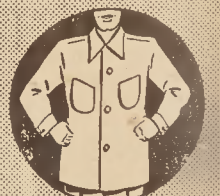
NEW, LONGER LENGTH