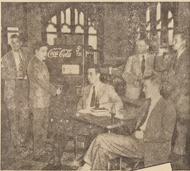
Campus Center Princeton University Princeton, New Jersey