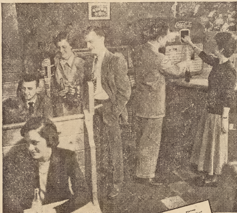
Hasty Tasty University of Wisconsin Madison, Wisconsin