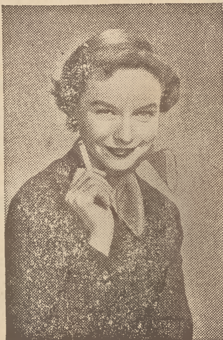
Actress Diana Lynn: This is the best filter of all—L&M's Miracle Tip. The smoke is mild, yet full of flavor.