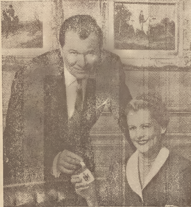
Mr. and Mrs. Stu Erwin, stars of TV's great "Stu Erwin Show": As we say on TV, this certainly is the Miracle Tip. L&M's filter beats 'em all.