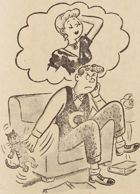
When you're flat broke and feeling kind of mean...

"Coke" is a registered trade-mark. © 1955, THE COCA-COLA COMPANY