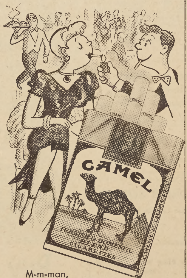
M-m-man, that's PURE PLEASURE!

For more pure pleasure... SMOKE CAMELS! No other cigarette is so rich-tasting, yet so mild!