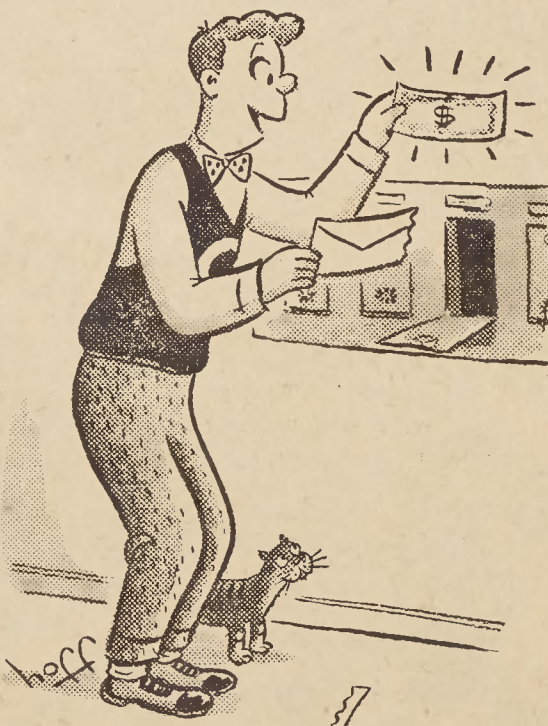
And Pop comes through with some spending green...