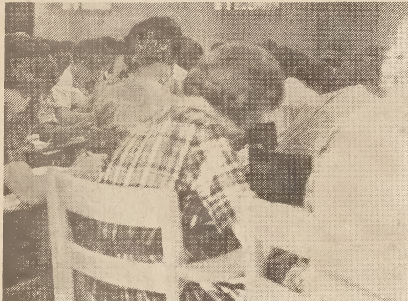
Tests, tests, and tests filled the days of the freshmen as they learned their proficiency in the languages and mathematics.